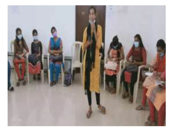
Orientation and Feed Back of the Campaign