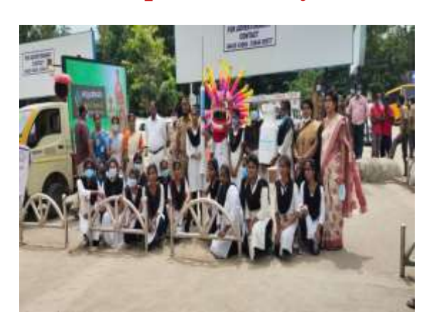
Place: T.K.Puram Village