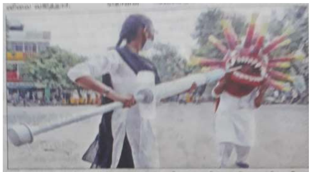
காட்பாடி காத்திதகர் கல்யாண மண்டபம் நடின்பாணாலில், கல்லுமி மணையிகள் சம்பில், கிரண தடுப்பூசி குதித்த விழிப்புணங்கு கலைதிகழ்ச்சி நடத்தது.