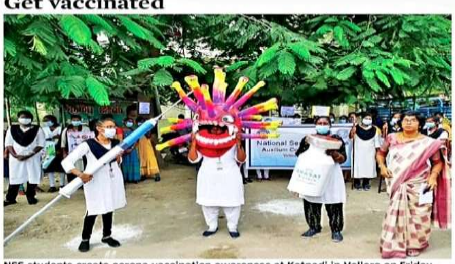
NSS students create corona vaccination awareness at Katpadi in Vellore on Friday.