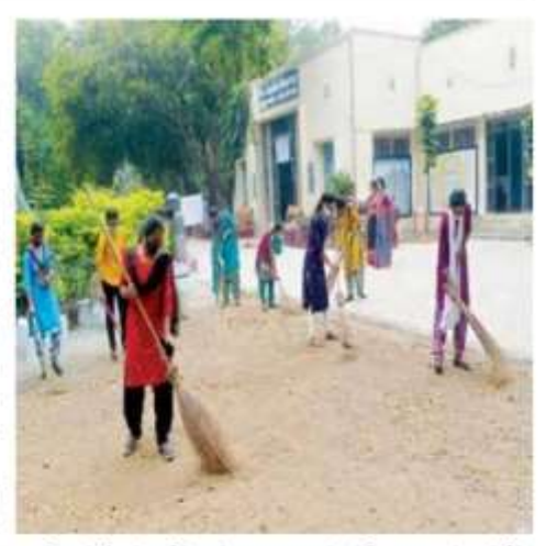
🛦 வேலூர் கோட்டையில் உள்ள அரசு அருங்காட்சியக வளகம் உள்ளிட்ட பகுதிகளில் தூப்மை இந்தியா திட்டத்தின் கீழ் தூய்மைப்படுத்தும் பணியில் ஈடுபட்ட அக்சீலியம் கல்லூரி மாணவிகள்.